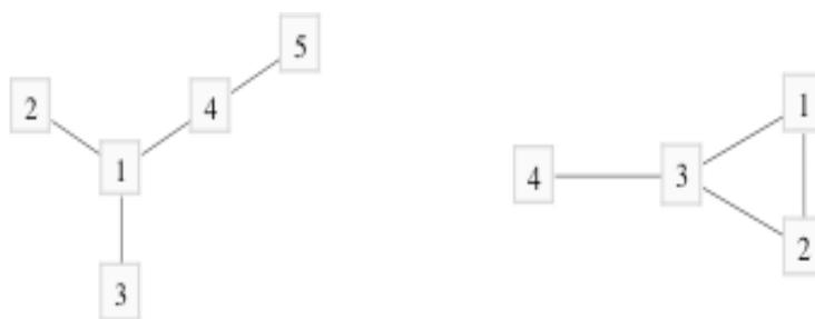
Figure 3: Graphs with four edges distinct from P_4 , C_4 or K_{1,4} .

are two connected (p, 4) -graphs in addition to P_4 , C_4 or K_{1,4} (see Figure 3). The corresponding graphicahedra of rank 4 are clearly not regular; their automorphism group is S_5 \times C_2 or S_4 \times C_2 , respectively, with the factor C_2 arising from the graph symmetry. For the graph on the left, the graphicahedron has twenty-five facets, ten permutahedra, five regular toroids \{6, 3\}_{(2,2)} , and ten hexagonal prisms. For the graph on the right, the graphicahedron has seven facets, of which two are permutahedra, four are regular toroids \{6, 3\}_{(1,1)} , and one is a regular toroid \{6, 3\}_{(2,2)} .